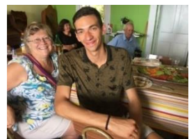
A tourist and a homeless person sharing the same table.