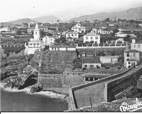
Photo of the Chapel from the 1800s, showing the peak on which it was built.